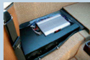
Optimised GRP subwoofer housing with integrated 4-channel amplifier for a W113