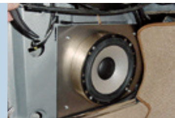
Solid red casted ring for 16 cm loudspeaker with screwed in plate on the original mount points