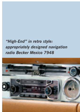
"High-End" in retro style: appropriately designed navigation radio Becker Mexico 7948