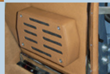
2-way front system for the foot space of a W111